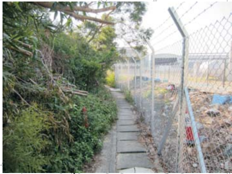
Proposed Landing Point